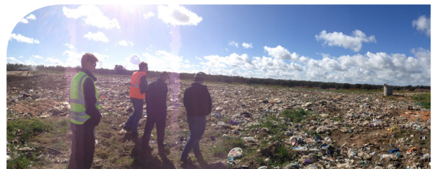
AEA Value & Delivery

AEA has a rich history of small to large scale projects, and is able to cater to projects of any size. We are confident in our ability to provide pragmatic, timely and cost effective auditing and technical services.